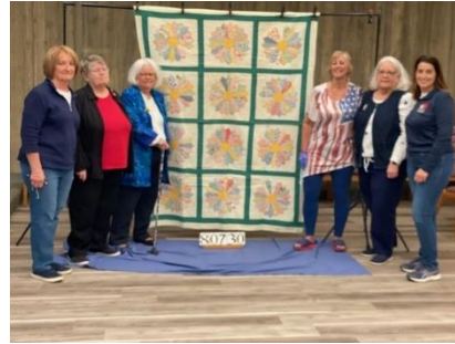
Wheeling members at Quilt Documentation