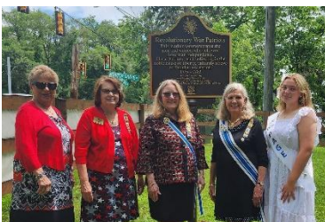
Preserving history and promoting patriotism