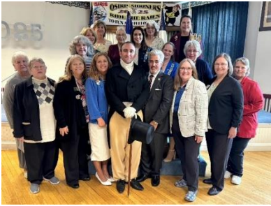
DAR members WITH General Lafayette