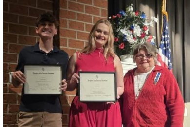
We celebrate our sparkling youth