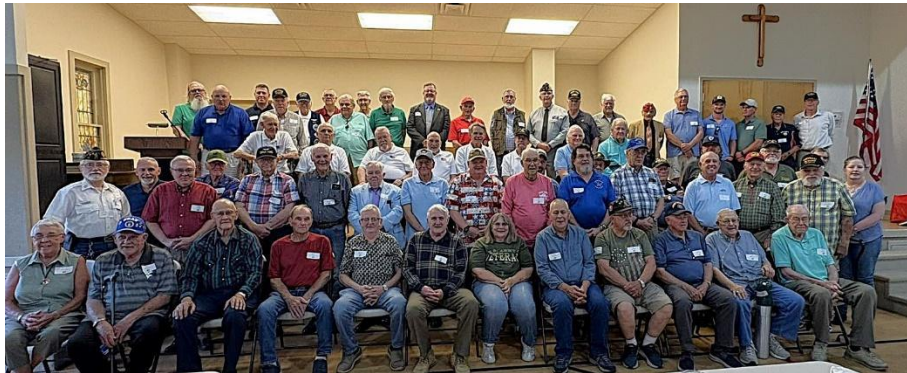
We honor our veterans

Continuing an annual tradition, the Shenandoah Valley Chapter hosted its 20th Anniversary of the “Thank You Veterans Dinner!” on June 3, 2025. While the dinner was catered, chapter members filled the dessert table with many homemade goodies. Entertainment was provided by The Blue and Grey Chorus, an all- time favorite. A highlight of the evening is when they sing the theme songs of each service branch, and veterans of each stand with the singing of their song.