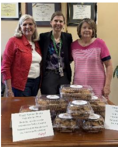
Giving back to our educators