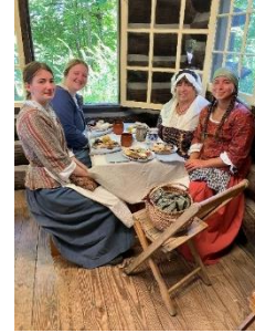
Ladies at Fort Henry tea