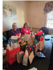
William Henshaw Chapter Members – Christmas Stockings Drop off 2025 William Henshaw Chapter Christmas Luncheon - 2025