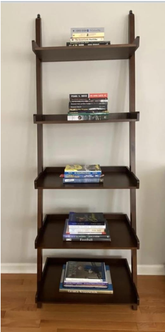
WVDAR Little Library