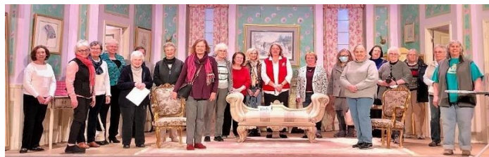
Bee Line Daughters explore the set designed for "Always a Bridesmaid" at the Old Opera House.

As is so often the case in communities like Charles Town, ties between past and present can become so enmeshed into everyday life as to go almost unnoticed. As now seems obvious, Bee Line's Daughters and the Old Opera House have been intimately involved with the growth and development of one another. But their many connections needed a reminder. Rediscovering those connections has been an unexpected and happy result of Bee Line's February meeting at the Old Opera House.