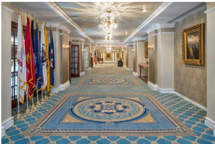
The 2nd Floor Parade Hall, The Army & Navy Club

The Army and Navy Club at Farragut Square 901 17th Street Northwest Washington, DC