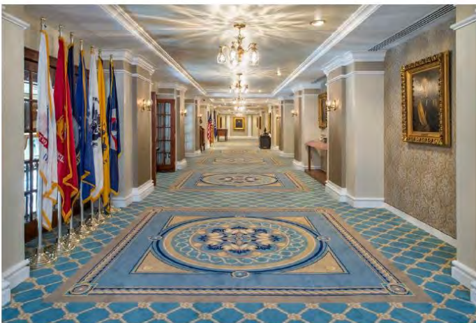
The 2nd Floor Parade Hall, The Army & Navy Club

The Army and Navy Club at Farragut Square 901 17th Street Northwest Washington, DC