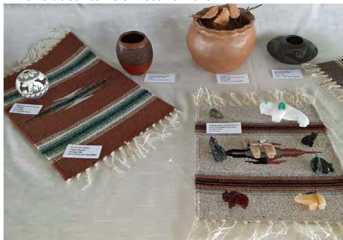
Modern versions of the trade goods that would have traveled up the Santa Fe Trail. Shown are examples of Rio Grande textiles and Native crafts, including pottery and stone-carved animal fetishes, some with medicine bundles.