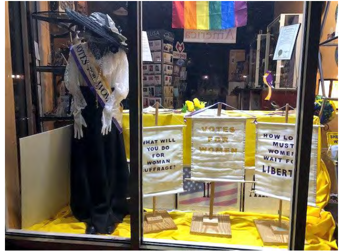
Pack Horse Ford Chapter’s Constitution Week Display at Dickinson & Wait shop in Shepherdstown