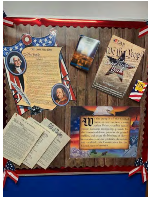
Constitution Week Display for 5th grade at Mountainview Elementary School in Morgantown