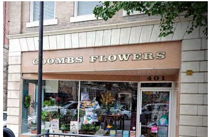
Window Display at Coombs' Florist in downtown Morgantown