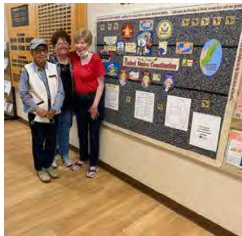
Daniel Davisson Chapter decorated a bulletin board about the Constitution at the Bridgeport Public Library, for Constitution Week.

On October 5 th , members of Daniel Davisson Chapter NSDAR donated their DAR National Day of Service items to the Louis A. Johnson VA Hospital. At their September meeting, members collected an extensive amount of "Baby Bundle" items for pregnant veterans.