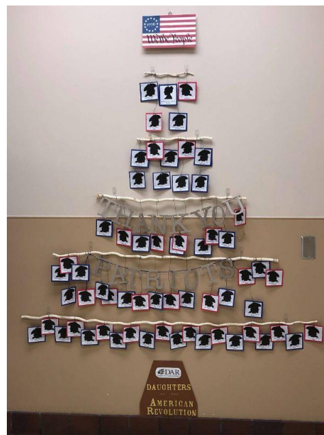
The July tree, decorated with symbolic representations of the Patriots claimed by Bee Line members.