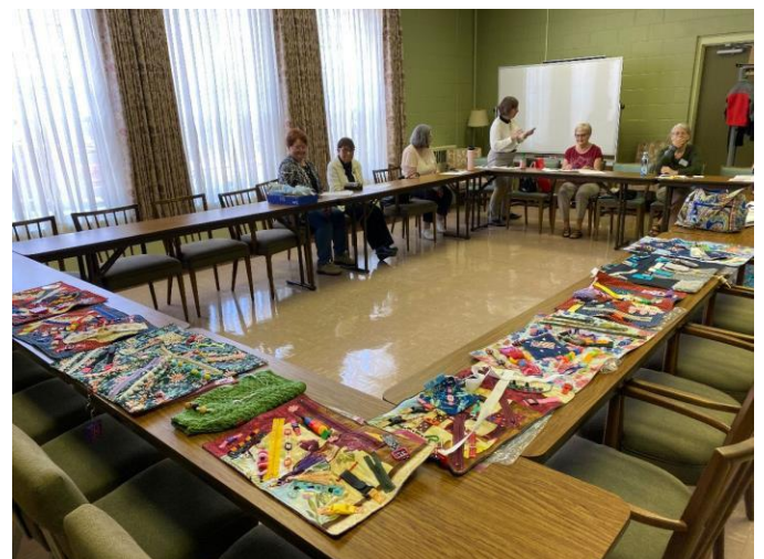
Donated fidget blankets