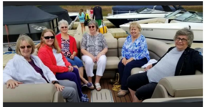
Some Blackwater Daughters enjoyed Deep Creek Lake.