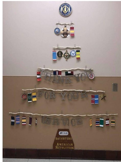
The May/June tree, complete with service ribbons and medals of valor.