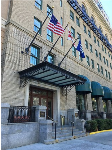
WV Breakfast at Continental Congress 2021

For nights Thursday, March 11 - Saturday, March 13, 2021