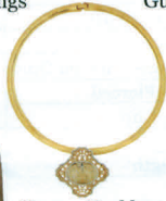
Omega Necklace (pin sold separately)