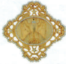
Celebration Eagle Pin